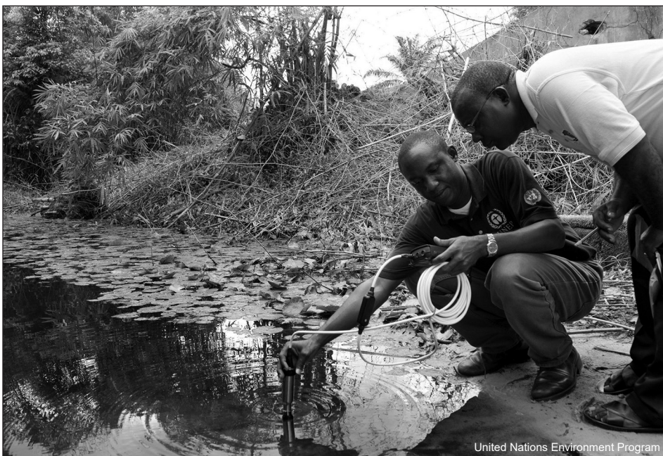
The United Nations Environment Program (UNEP) conducted an environmental assessment in Nigeria in 2010.

Another case, brought by 45,000 Bille and Ogale farmers from Western Ogoniland, goes after the generalized harm to the community in the most direct manner of any of the cases. The Ogale based their claims off of the 2011 UNEP report, showing that the Ogale community had the most serious case of groundwater contamination in the territory, including drinking water containing carcinogenic ben-